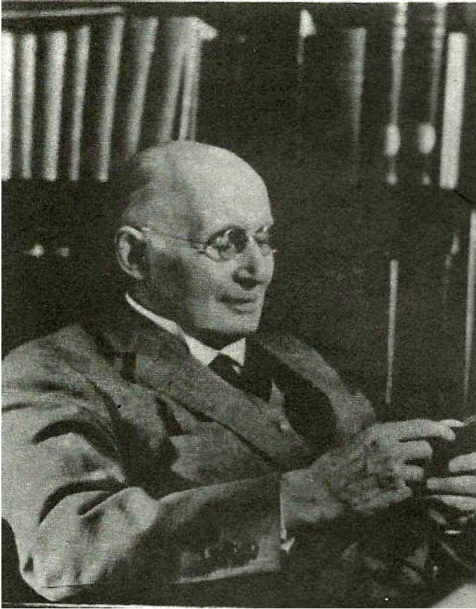
Alfred North Whitehead.

1861-1947.